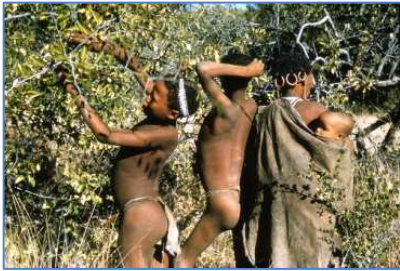
San Bushwomen Collecting Berries

Last month [8]: "Jobs", "employees" and "employers" are very recent institutions – and our mentalities are not designed to cope with them.