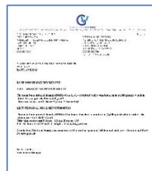
Bone test results (in Nicole's maiden name)