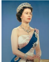
Death Certificate [1] Queen Elizabeth II in 1959 [2]

There was considerable controversy about the Queen's registered "cause of death". It was given as 'Old Age'. You might think that this is perfectly reasonable considering that she was 96 years old and had no obvious degenerative disease like CVD, cancer or dementia.