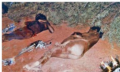
Aboriginal foragers sleeping

Troxel suggests that a biological drive is at work: A forager is very vulnerable when asleep in the open on the savanna and one derives a sense of safety in connection with others.