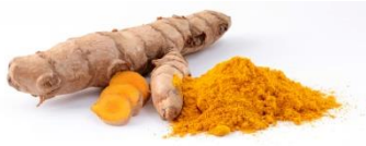
Turmeric root and powder

Q. An agèd parent has developed the early stages of Alzheimer's. I see on the Internet that Turmeric could be helpful. Thoughts?