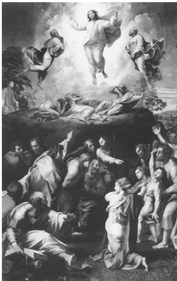
Fig. 1. Raphael's Transfiguration of Christ . (Reproduced with permission from ref. 5.)

ical Culture . He advised readers how to develop themselves physically, how to maintain their health, and how to cope with illness. He illustrated it with photographs of himself lightly clad, with muscles bulging (Fig. 3A). Each issue carried articles about sickly men and women who became healthy, strong, and beautiful through proper diet and exercise. The magazine's circulation had reached 500,000 by the end of World War I. Macfadden was widely recognized, and one of his followers, Angelo Siciliano, won Macfadden's "America's Most Perfectly Developed Man" contest twice. Using the winnings, Siciliano went on to establish his own muscle-building business under the name of Charles Atlas.