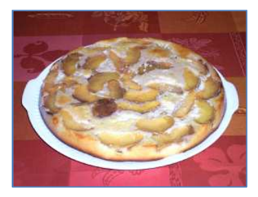
Peach Upside-Down Tart Yield: 12 servings

Ideal for afternoon tea. This classic dessert would be popular in any traditional English teashop. The fruit, being cooked, should not be a digestive difficulty even at the end of a meal.