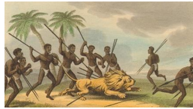
Hunter-gatherers trap a lion