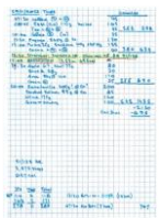
Food Diary [16]